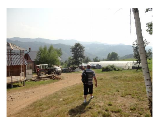
greenhouses that are already operating and, opposite, the house for the farm workers.